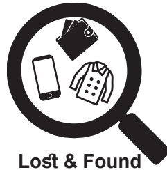
Lost & Found