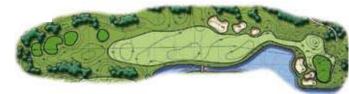
HOLE 3 PAR 4 — 420 / 400 / 370 / 325 YARDS

A medium length par 4, the 1st is a gentle opening to the round. The tee shot needs to clear a low area and skirt two large bunkers on the right for a clear shot into the elevated but well-protected green.