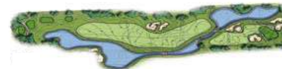
HOLE 2 PAR 5 — 520 / 505 / 475 / 430 YARDS

Given the arrangement of the lake, fairways and bunkers short of the green, there is really no alternative to an aerial approach to this green.