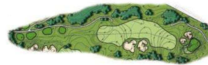
HOLE 1 PAR 4 — 390 / 375 / 335 / 300 YARDS

A medium length par 4, the 1st is a gentle opening to the round. The tee shot needs to clear a low area and skirt two large bunkers on the right for a clear shot into the elevated but well-protected green.