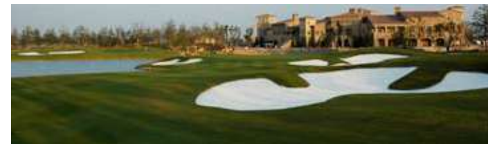
SHESHAN GOLF & COUNTRY CLUB, SHANGHAI, CHINA

DESIGNED BY WORLD-RENOUNDED GOLF ARCHITECTS.