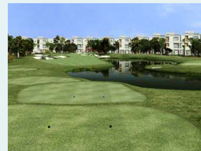
DEFENCE RAYA GOLF RESORT, HOLE 16

Nelson & Haworth designs are noted as much for their visual drama as for their appeal to golfers of all levels.