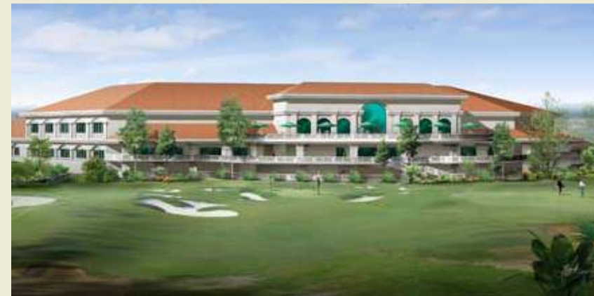
DEFENCE RAYA GOLF & COUNTRY CLUB

You'll enjoy the best that life has to offer, within tranquil gated gardens that provide 24-hour security and peace of mind for you and your family.