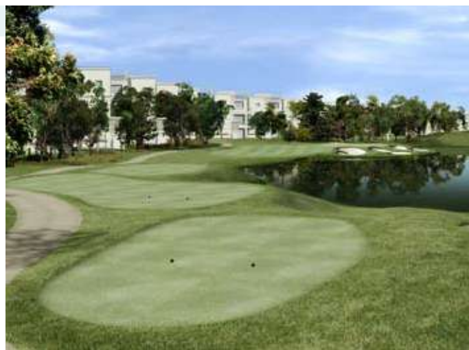
THE STUNNING VIEWS OF DEFENCE RAYA GOLF RESORT